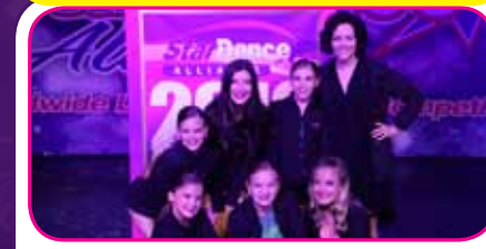
9-11 • Rock City Dance Center