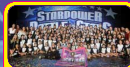
12 & Over Grand Line • Star Struck Dance Studio