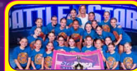
9-11 • Big City Dance Center