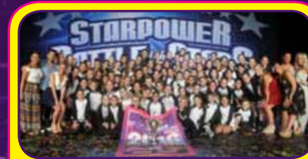
9-11 • Star Struck Dance Studio