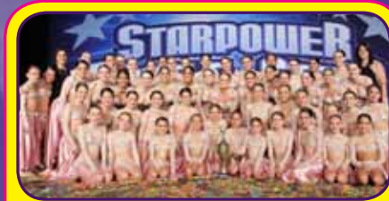
11 & Under Grand Line • Northeast Dance Academy