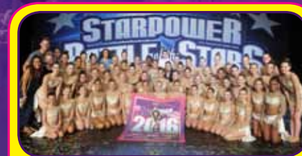
12-14 • Expressenz Dance Center