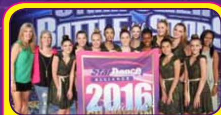
12-14 • Masters Upper Level