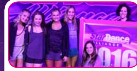
15-19 • Rock City Dance Center