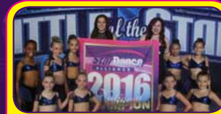
8 & Under • Innovation Dance Company