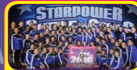
11 & Under Grand Line • Dancetown