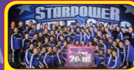
11 & Under Grand Line • Dancetown