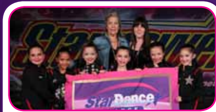
8 & Under • That's Dancin'