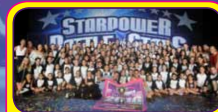
12 & Over Grand Line • Star Struck Dance Studio