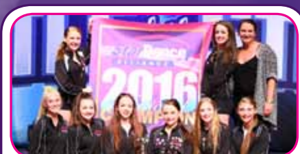
15-19 • Gainesville Dance Center