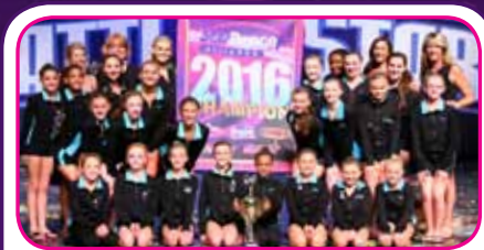
9-11 • Jersey Cape Dance and Gymnastics