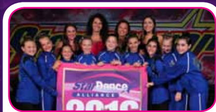
9-11 • First Class Dance Academy