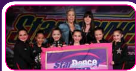
8 & Under • That's Dancin'