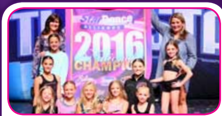
8 & Under • Studio 19