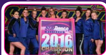
12-14 • World of Dance