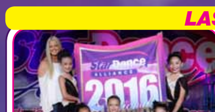
8 & Under • Just Plain Dancin