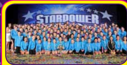
9-11 • Studio L