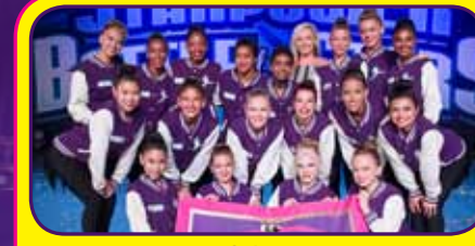
12-14 • Strictly Rhythm