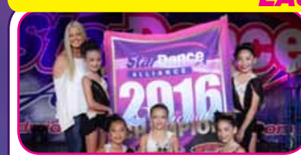
8 & Under • Just Plain Dancin