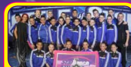
15-19 • Dancetown