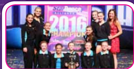
12-14 • Jersey Cape Dance and Gymnastics