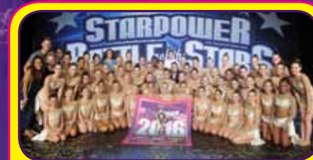
12-14 • Expressenz Dance Center