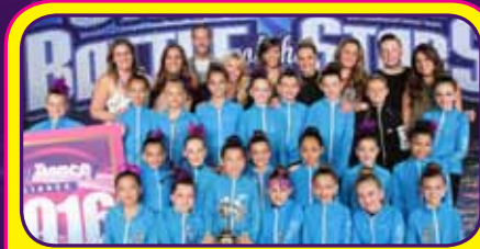
8 & Under • Studio L