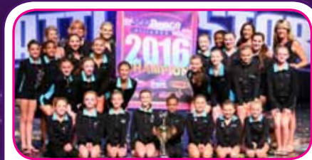
9-11 • Jersey Cape Dance and Gymnastics