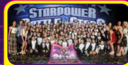
9-11 • Star Struck Dance Studio