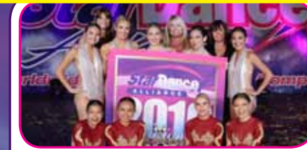
12-14 • Dancers Edge