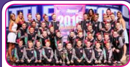
11 & Under Grand Line • Kay's Act II