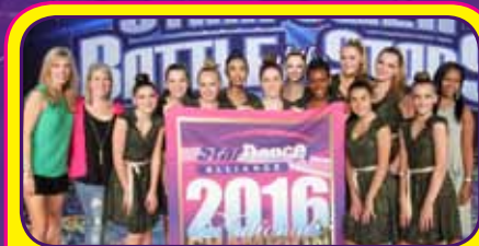
12-14 • Masters Upper Level