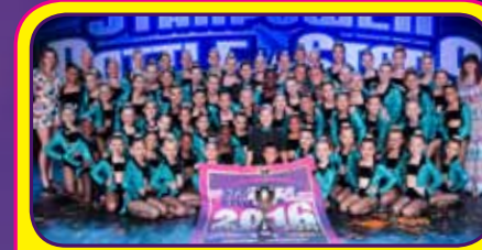
Grand Line • The Dance Corps