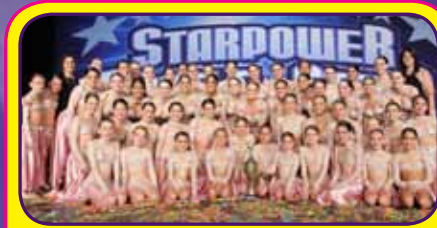
11 & Under Grand Line • Northeast Dance Academy