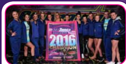
15-19 • World of Dance