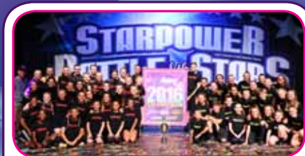
12 & Over Grand Line • Morton's Dance Center