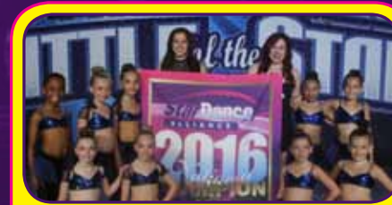
8 & Under • Innovation Dance Company