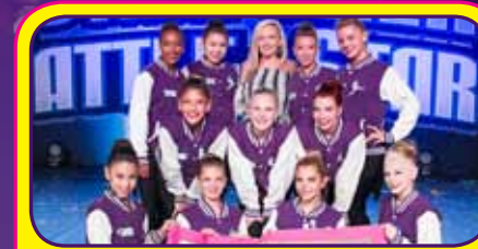
15-19 • Strictly Rhythm