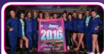
15-19 • World of Dance