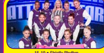
15-19 • Strictly Rhythm