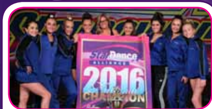
12-14 • World of Dance