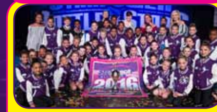
8 & Under • Strictly Rhythm