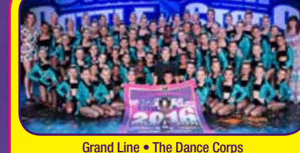
Grand Line • The Dance Corps