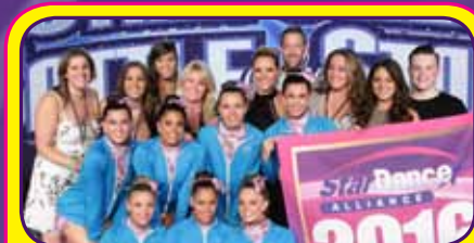
15-19 • Studio L