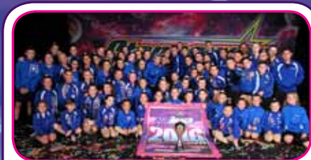
12 & Over Grand Line • Dance Sensations Dance Studio