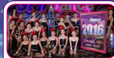
9-11 • The Dance Spot