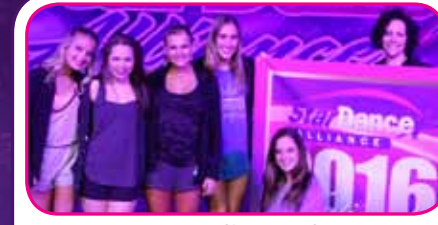
15-19 • Rock City Dance Center