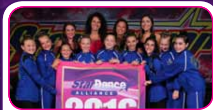
9-11 • First Class Dance Academy