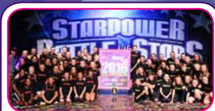
12 & Over Grand Line • Morton's Dance Center