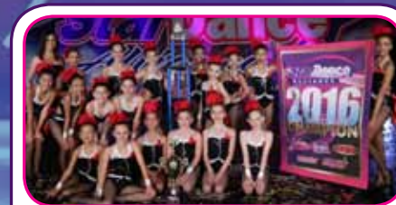
9-11 • The Dance Spot