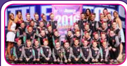
11 & Under Grand Line • Kay's Act II