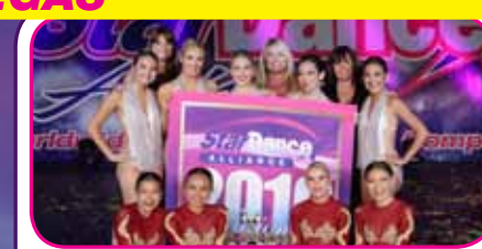
12-14 • Dancers Edge