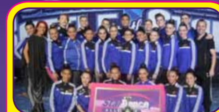
15-19 • Dancetown