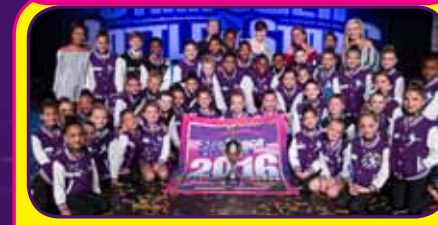
8 & Under • Strictly Rhythm