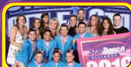
15-19 • Studio L