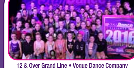
12 & Over Grand Line • Vogue Dance Company