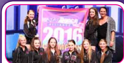
15-19 • Gainesville Dance Center