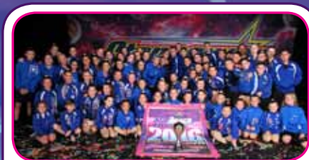
12 & Over Grand Line • Dance Sensations Dance Studio