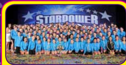
9-11 •