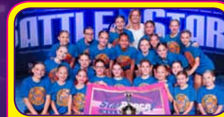
9-11 • Big City Dance Center