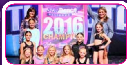
8 & Under • Studio 19