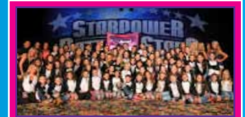
9-11: Starstruck Dance Studio