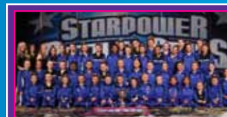
11 & Under Grand Line: NYC Dance