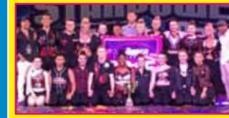
15-19: Xtreme Dance Force