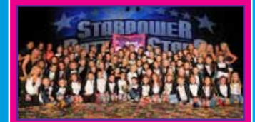
8 & Under: Starstruck Dance Studio