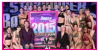
12-14: Innovation Dance Company