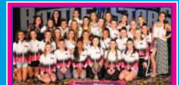
15-19: Next Jenneration