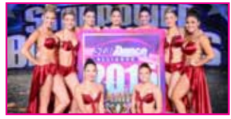
15-19: Dancers Edge