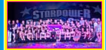
12 & Over Grand Line: Xtreme Dance Force