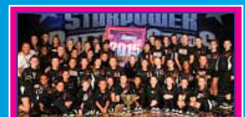
12 & Over Grand Line: Morton's Dance Center