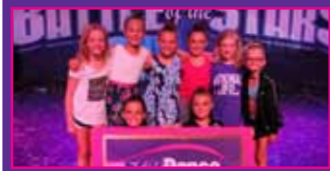
8 & Under: Spotlight Productions