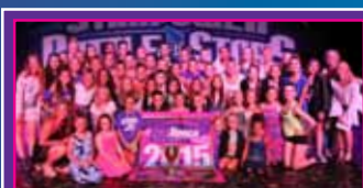
12 & Over Grand Line: Spotlight Productions