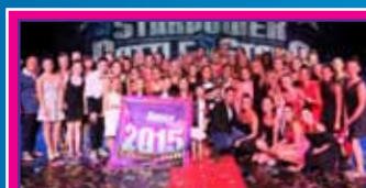
12 & Over Grand Line: