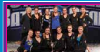
15-19: Starstruck Performing Arts