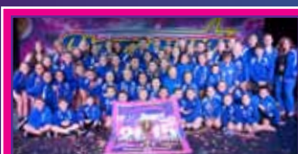
12 & Over Grand Line: Dance Sensations Dance Studio