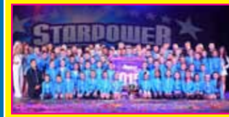
9-11: Studio L