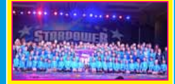
11 & Under Grand Line: Studio L