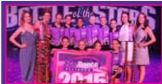
9-11: Dancers Burlington