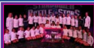
11 & Under Grand Line: Shooting Stars School of P. A.