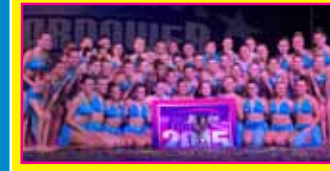
12-14: Expressenz Dance Center