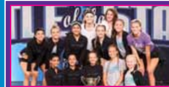
9-11: Art in Motion Dance Studio