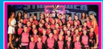
11 & Under Grand Line: Kay's Act II