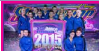
12-14: The World of Dance