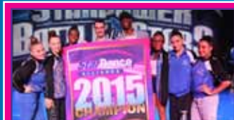
12-14: TKO Dance Academy