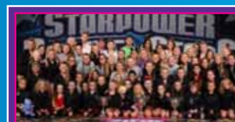
12 & Over Grand Line: Art in Motion Dance Studio