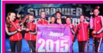
9-11: Little Red Dancing School