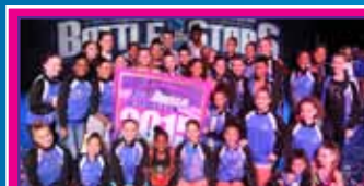
11 & Under Grand Line: TKO Dance Academy