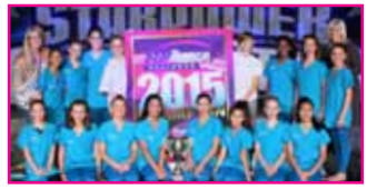
9-11: Just Plain Dancin