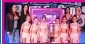
8 & Under: Northeast Dance Academy