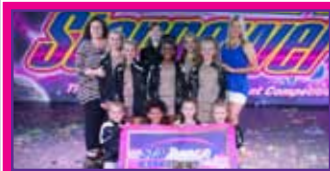
9-11: Center Stage Dance Studio