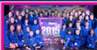
11 & Under Grand Line: The World of Dance