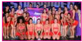
Grand Line: The Dance Spot