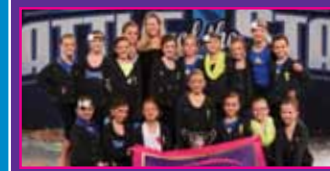
8 & Under: Starstruck Performing Arts