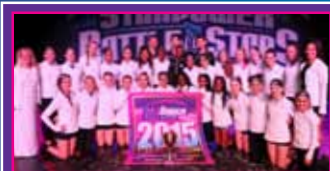
12-14: Shooting Stars School of Performing Arts