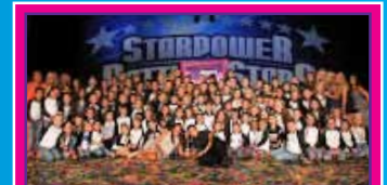
12-14: Starstruck Dance Studio